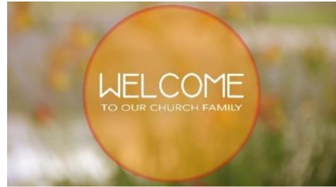
New Members joined LP UMC June 28