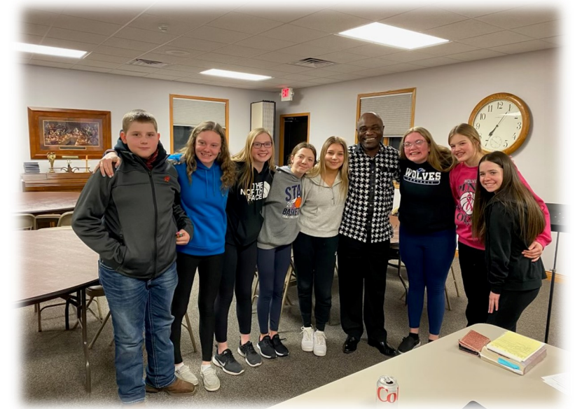
Confirmation Class Feb. 1st.